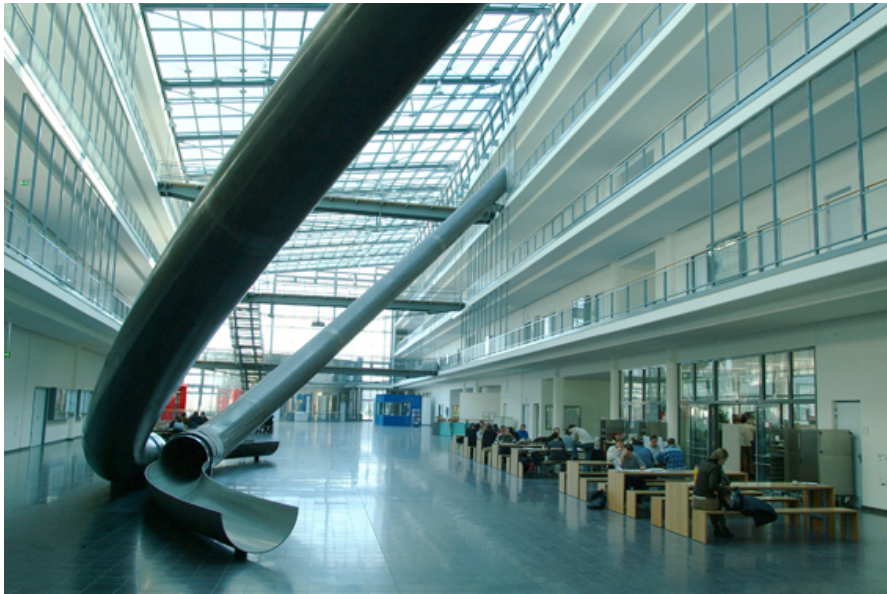
Figure 1.5: For pictures with the same name, the direct folder needs to be chosen.