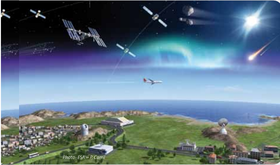
Communication & Navigation